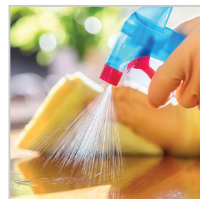
Safe on Surfaces