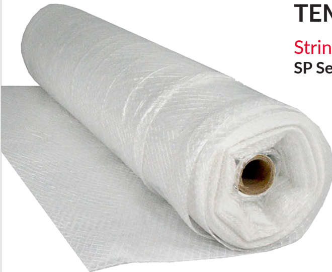
String Reinforced Poly Illustration >>>

E agle string reinforced poly sheeting is made from high strength polyethylene film manufactured with a tear resistant internal scrim reinforcement. Reinforced poly is used for various applications including construction enclosures, temporary containment, abatement covers, ground covers and underlayment. Poly sheeting may be installed vertically using scaffold wind clips, bungee ties, tie wire, wood-furring strips or fastening directly to a building or structure. All Eagle reinforced poly sheeting is tested and approved to meet today's industrial and construction standards.