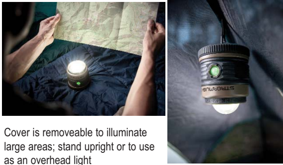
Cover is removeable to illuminate large areas; stand upright or to use as an overhead light