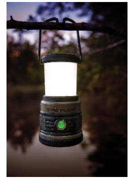
Ergonomic handle designed to lock in upright or stowed position; incorporated hook allows for hanging