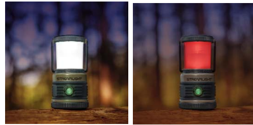
Four white C4 LEDs with high, medium and low modes Red LED with high and flash SOS modes