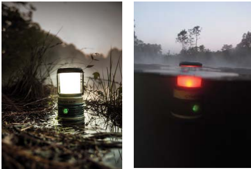
IPX7 waterproof to 1m submersion; it floats