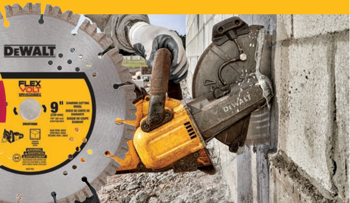
DWAFF8918 9" Ceramic Metal Cut-Off Wheel Type 1